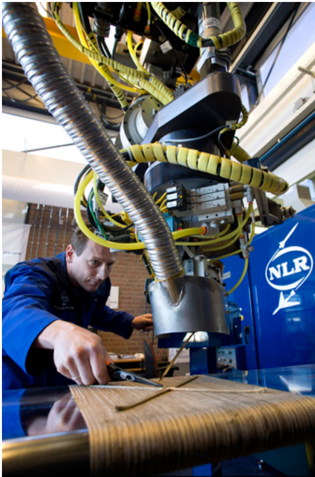
R&D Composites Lab at National Aerospace Laboratory (NLR)

Over the past few years various important MRO-companies have opted for Lelystad Airport. One of these prominent companies is QAPS/STTS, which opened a state-of-the-art paint shop at Lelystad Airport for aircraft up to Fokker 100/Embraer 195. Specto, an EASA/Part-145 approved maintenance company for aircraft components and specialized in composite repair and manufacturing, will also settle there.