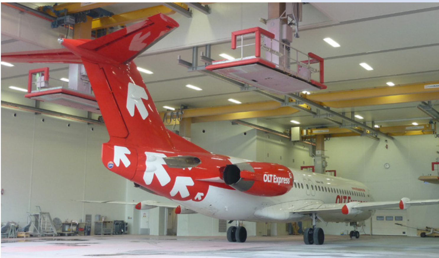
The brand new QAPS facility at Lelystad Airport

Please visit www.omfl.org or contact us at info@omfl.nl . Or for dedicated airport questions contact Lelystad Airport at info@lelystad-airport.nl .