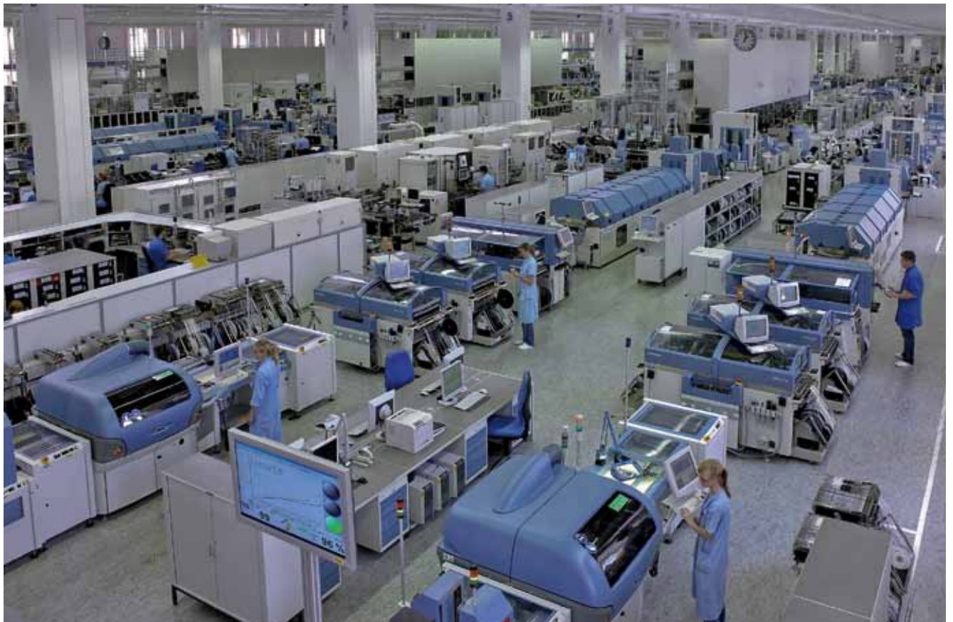
High tech production

The regional authority also actively stimulates innovation with the program for Technological and Environmental Innovation (TMI).