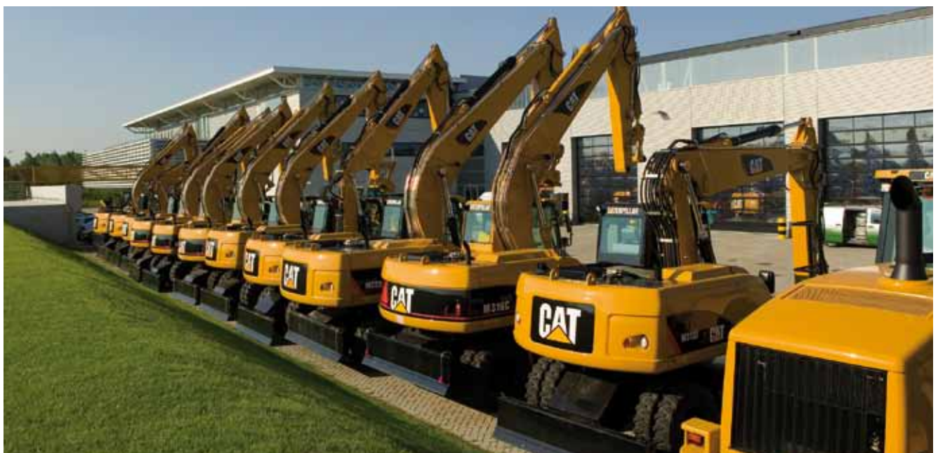
European distribution center

The Netherlands are also classified as one of the most 'wired' countries in the world, with a very stable energy and electricity supply. As far as IT is concerned, most of Flevoland has a high-capacity glass fiber network, both for domestic and business use.