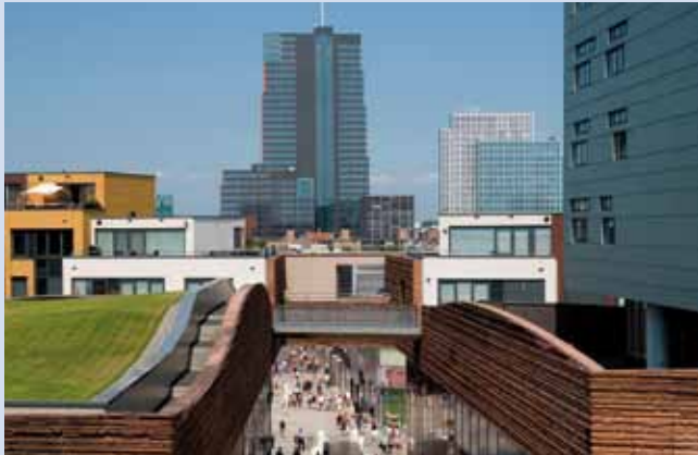
Photo cover: Almere City center