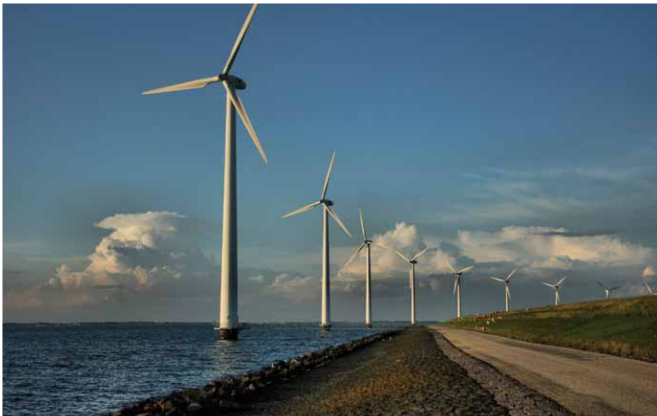
Windturbine park Flevoland

Flevoland has over 600 wind turbines generating over 650 Mw, which is one-third of the total wind energy capacity in the Netherlands. Being unique in this field, Flevoland is the leading province in the Netherlands.