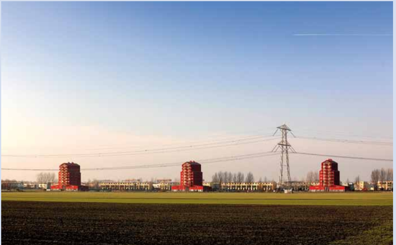
Architecture in Almere