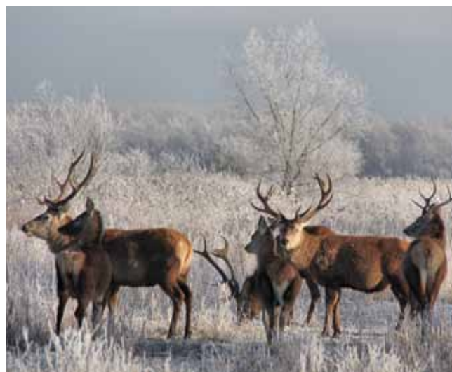
Wildlife at Oostvaardersplassen