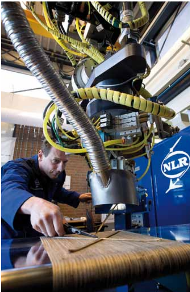
R&D Composites Lab at National Aerospace Laboratory (NLR)

Flevoland's quality of life and living facilities attract vast numbers from the top end of the labor market. 60% of the labor force commutes to the surrounding economic areas but is more than willing to accept a similar job in the immediate area, enabling Flevoland to draw from a vast reservoir of well-experienced and highly-educated staff.