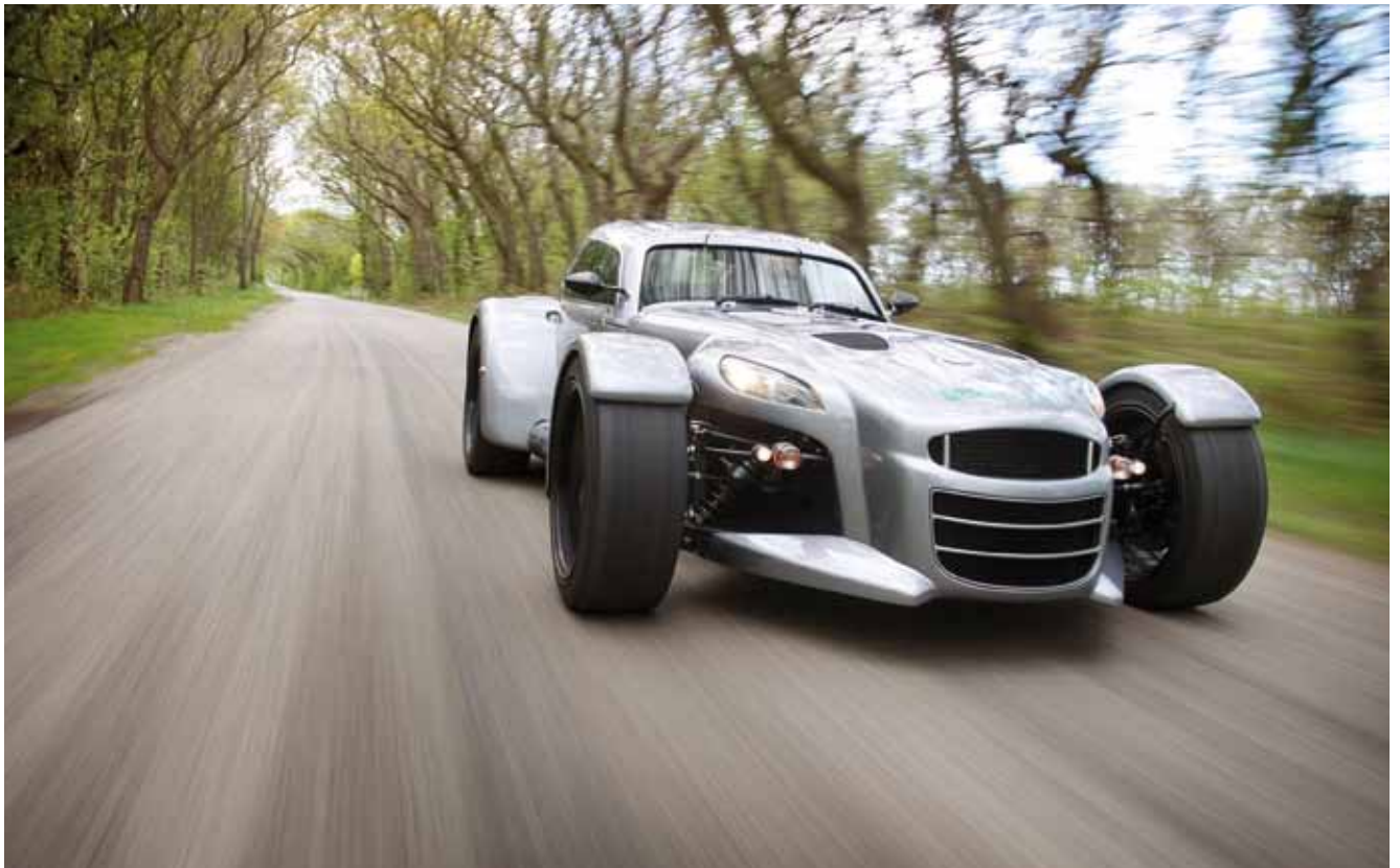
Donkervoort sportscar manufacturer Lelystad

Due to the presence of the Central Veterinary Institute and strong connections with nearby academic centers Amsterdam, Utrecht and Wageningen, Flevoland is a crossover in the Dutch bioregion connecting specialized local hotspots and disciplines and facilitating crossovers between academic centers and SMEs and between PPSs like Immuno Valley and Food Valley.