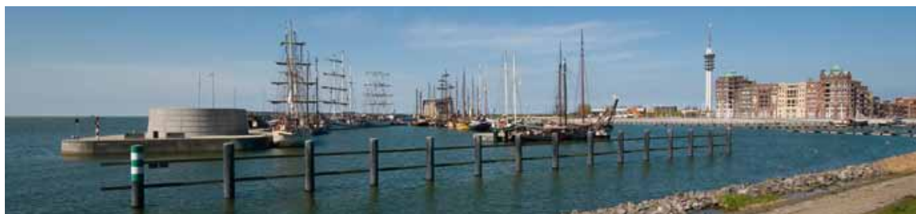
Batavia Harbor Lelystad